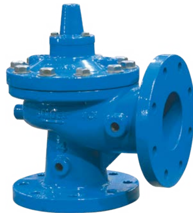
FIG. 1 Alternative models A206-PG Angle