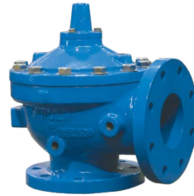
FIG. 1 Alternative model A106-PG Angle