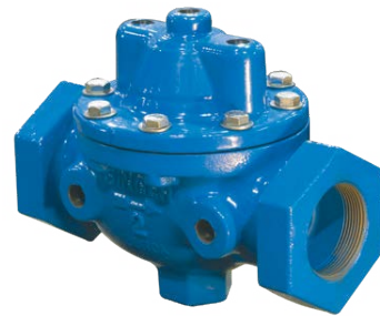
FIG. 2 Alternative model 106-PG THREADED