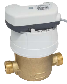
Water meter equipped with cyble sensor module