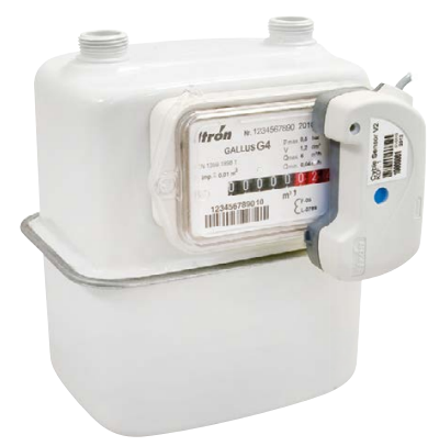
Gas meter equipped with cyble sensor module