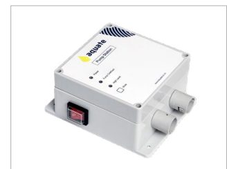
FIG. 2 Controller – manufactured to AS/NZS

For larger systems, additional features can be included if required.