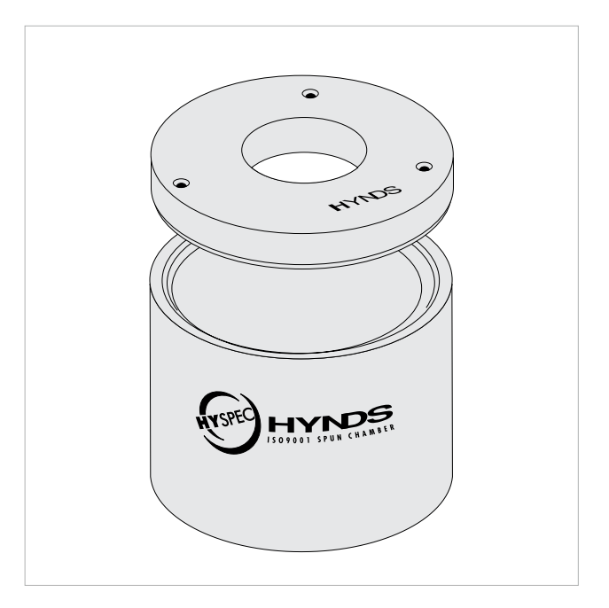
FIG. 2 Manhole riser and lid