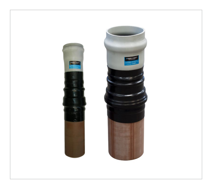
FIG. 1 Manhole Connectors