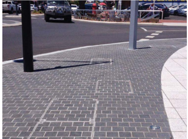
FIG. 1 XPAVE Installation