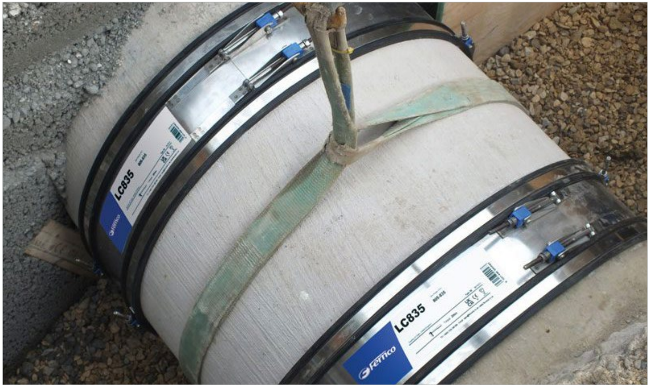
FIG. 2 Fernco Large Coupling insitu installation