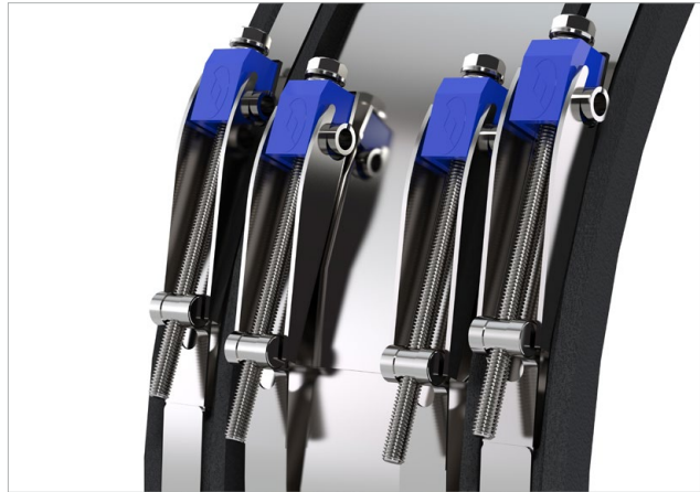
FIG. 1 Fernco Large Coupling bolting system